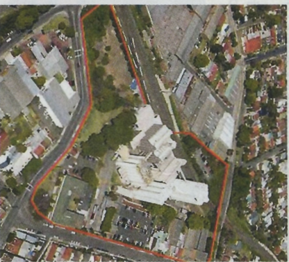
The development site is marked by the red line.